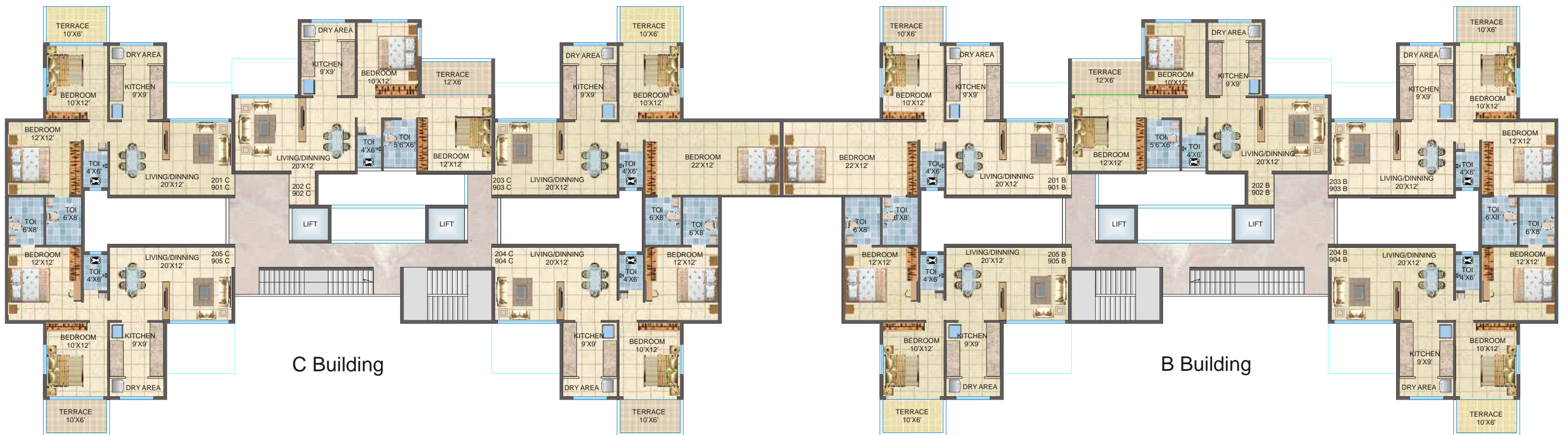
2nd & 9th floor plan