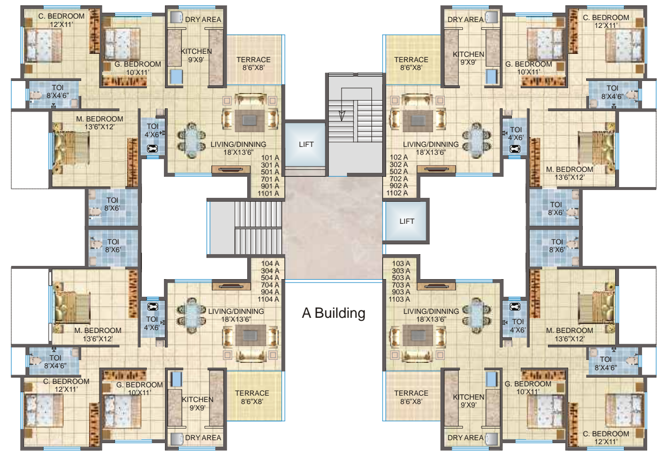
1st, 3rd, 5th, 7th, 9th & 11th floor plan