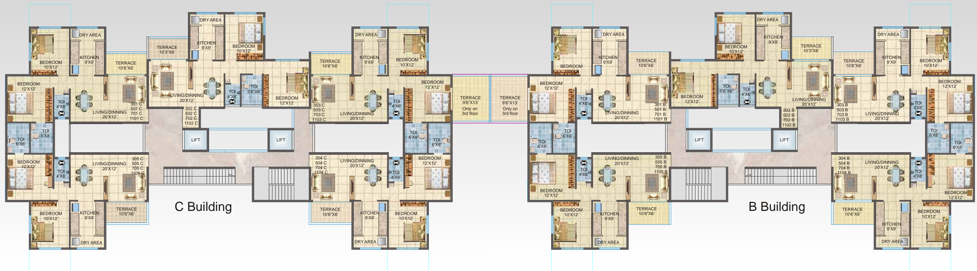
3rd, 5th, 7th & 11th floor plan