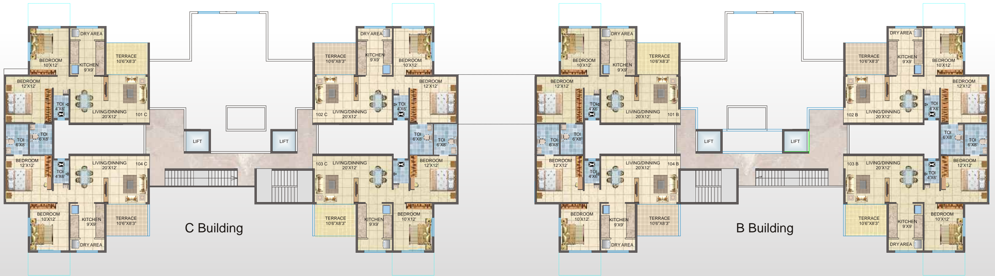
1st floor plan