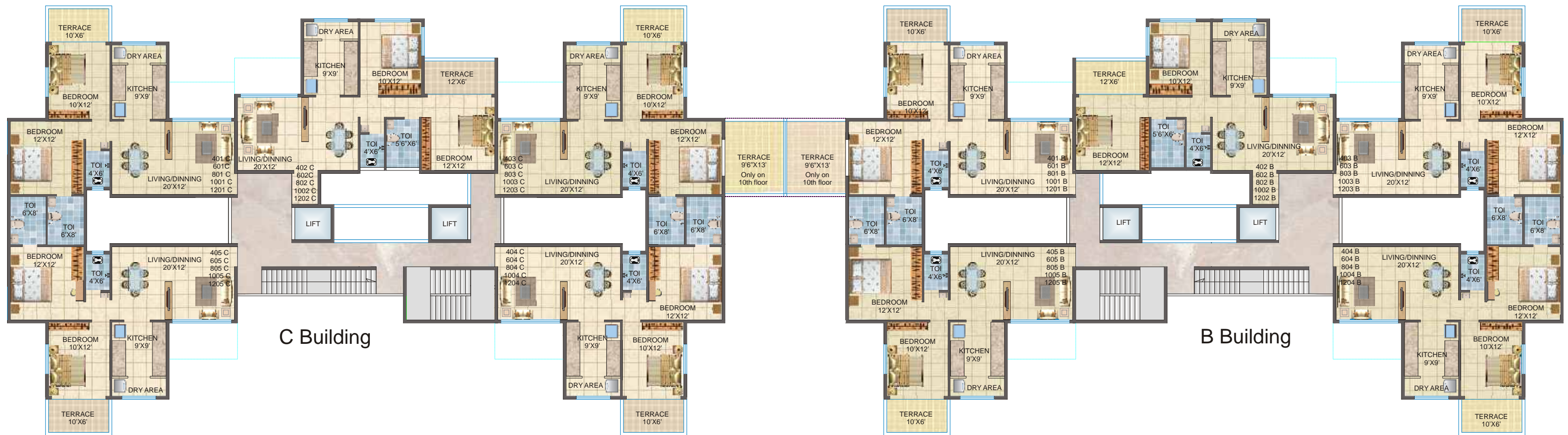
4th, 6th, 8th, 10th & 12th floor plan