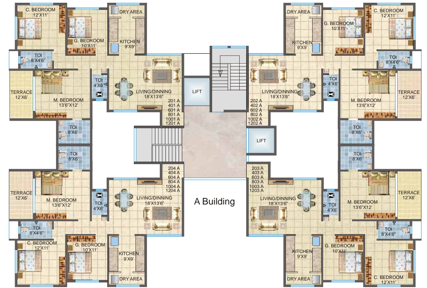
2nd, 4th, 6th, 8th, 10th & 12th floor plan